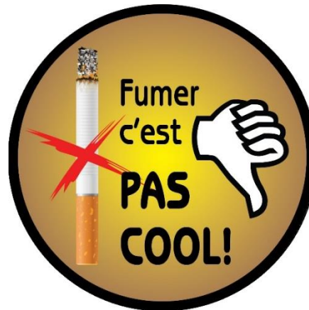
Smoking isn't cool logo used during the 2015 campaign.

The Fumer c'est pas cool! Campaign (Smoking Isn't Cool!) aimed to lead youth and those 50+ in committing to a tobacco-free lifestyle by setting a positive example among their families and friends.