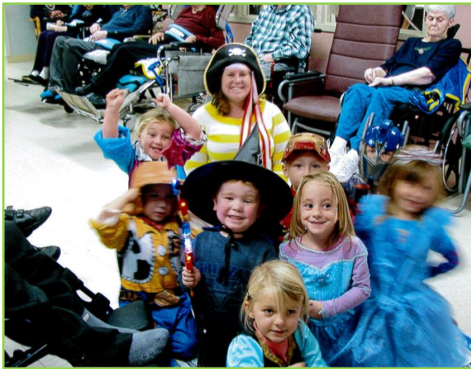
Westford Nursing Home's Volunteers in Training.

Activity Director then matches each student with a resident who also shares similar hobbies or once worked in their field of interest. Other students may express interest in office work, so they assist in the Nursing Home Office, in preparing charts for new admissions and/or orientation packages for new employees.