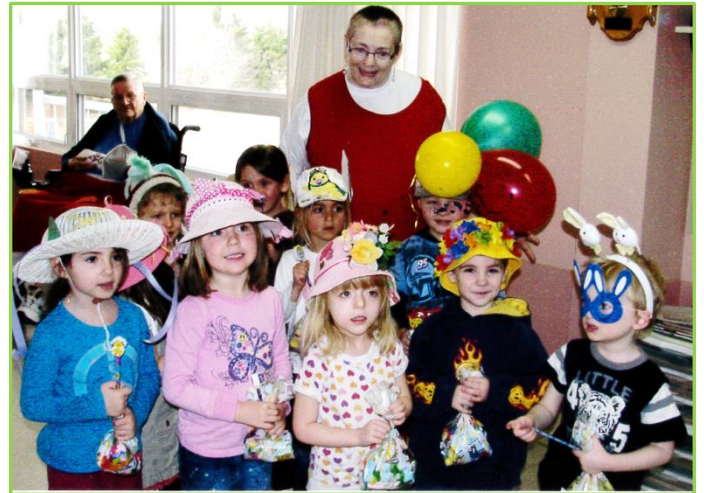
Crazy Hat Day, Easter 2015.

Playschool children and nursing home residents join together on a regular basis to celebrate the many holiday festivities throughout the calendar year. Preschoolers and residents alike also look forward to Crazy Hat Day ; a popular event in which the children create and wear “crazy hats”, bringing joy and colour to residents during social visits in the games room.